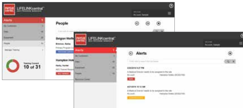
LIFELINKcentral AED Program Manager provides clear, comprehensive information about your AED program.

With LIFELINKcentral AED Program Manager, managing your AEDs has never been easier. Not only will you know for certain that your AEDs are ready when you need them, you'll also save time and money on your AED program management via our streamlined web portal which offers improved functionality and ease of use.